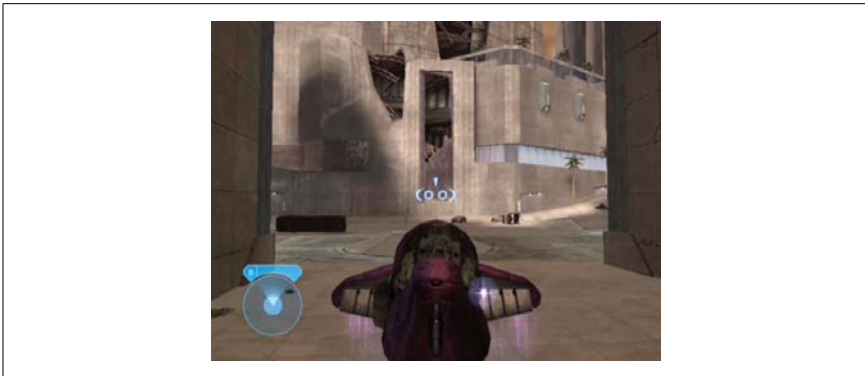
Figure 3-11. The soccer ball building

First, you will need to grab the Sputnik skull [Hack #16] . This will allow you to grenade jump considerably higher than normal. Next, make your way through Metropolis until you pass by a water fixture and reach the mission objective "Regroup with Marine forces in the city-center." This is just past the location of the Catch skull [Hack #10] . After the water fixture, you will come out into an open street and the soccer ball building will be straight in front of you (see Figure 3-11 ).