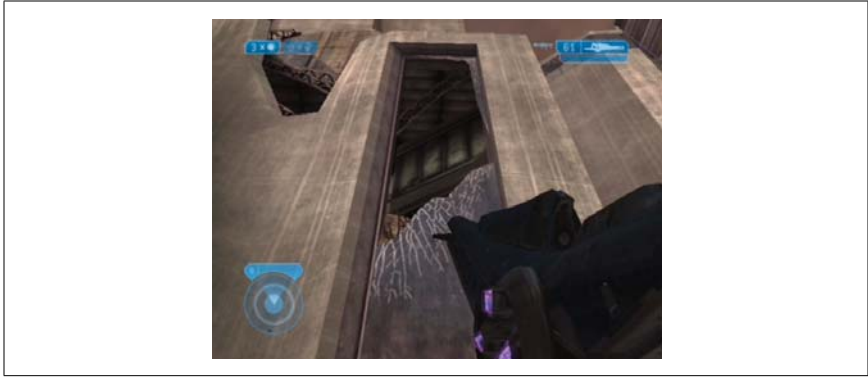
Figure 3-12. The landing zone for your grenade jump