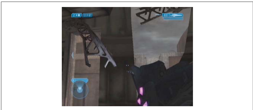
Figure 3-14. The first and second girders

Once you have jumped up the girders, you can simply crouch jump [Hack #1] up to the level of the soccer ball. After jumping to the roof, the room with the Catch skull is only a short walk to your right (see Figure 3-15 ).