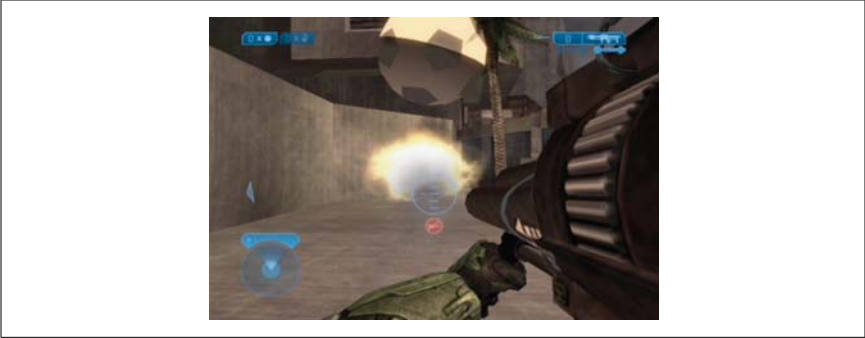
Figure 3-17. Kickin' around the ball