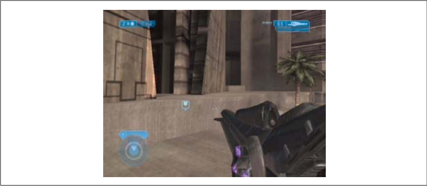
Figure 3-15. Straight ahead to the egg

The giant ball is hiding in a dark room just around the corner (see Figure 3-16).